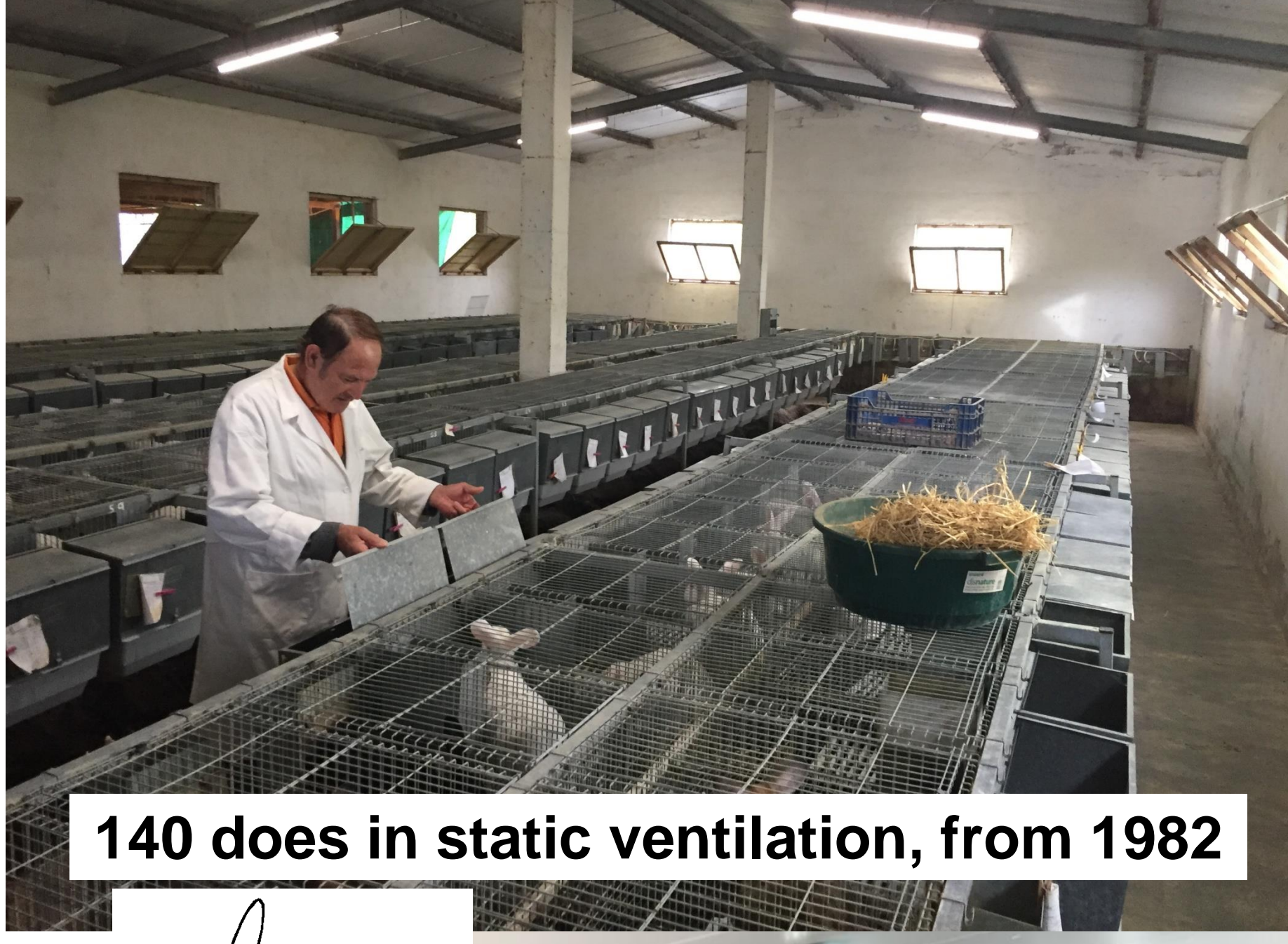
140 does in static ventilation, from 1982