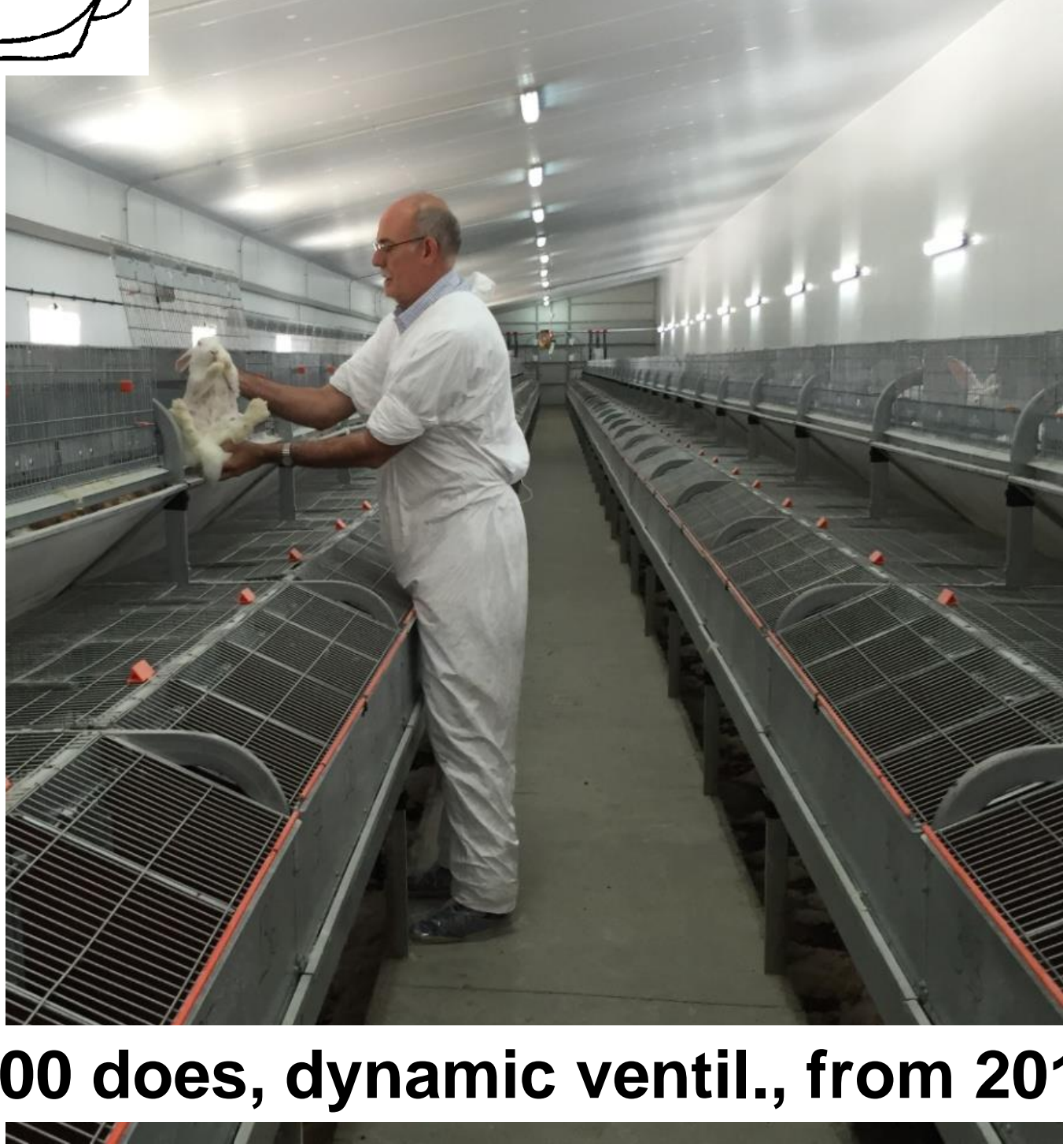
1000 does, dynamic ventil., from 2014