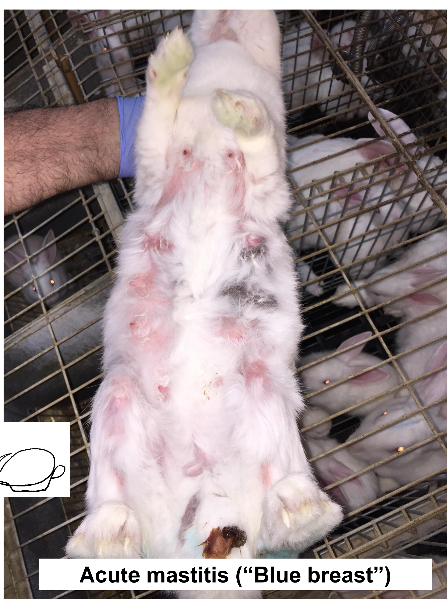
Acute mastitis ("Blue breast")