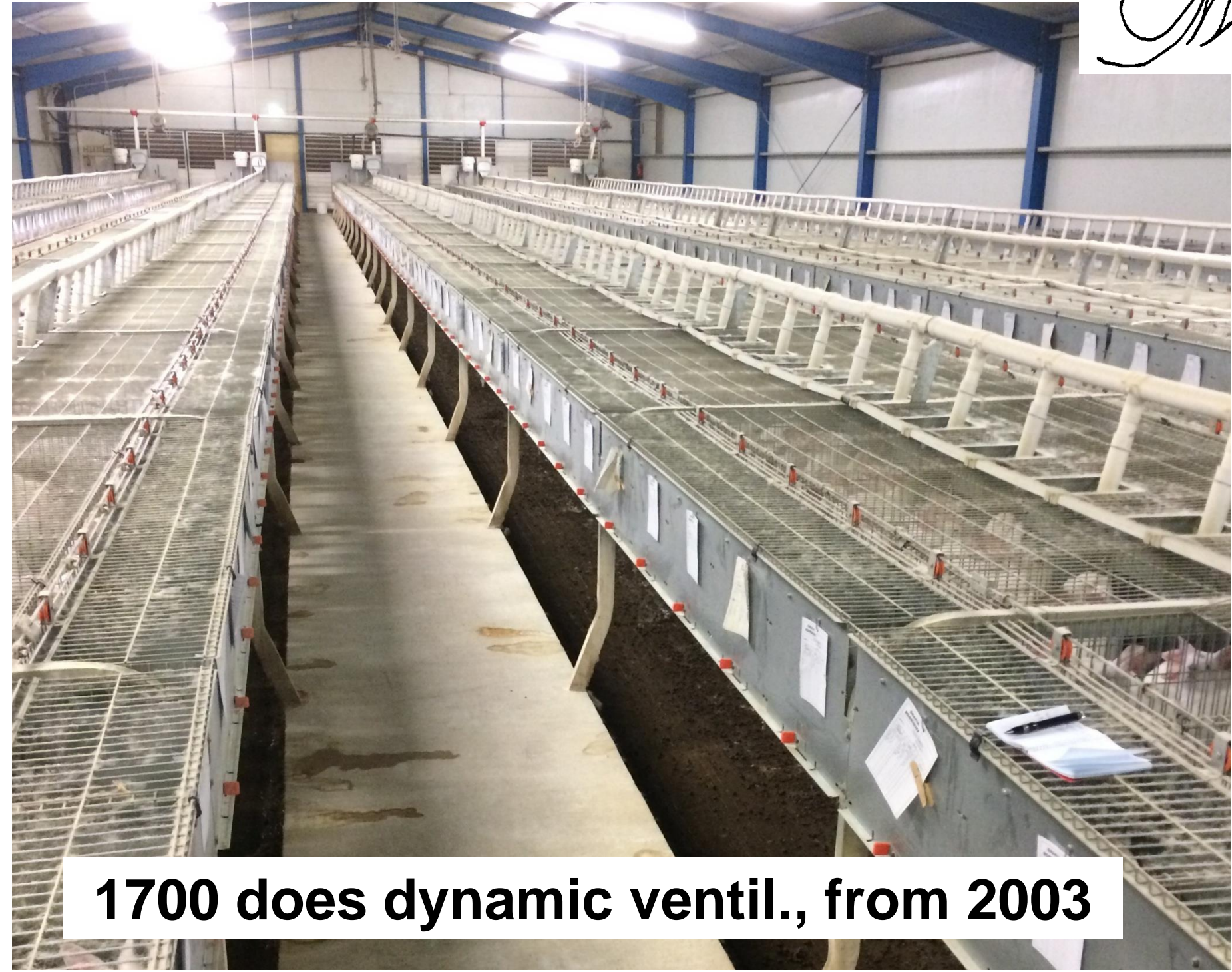
1700 does dynamic ventil., from 2003