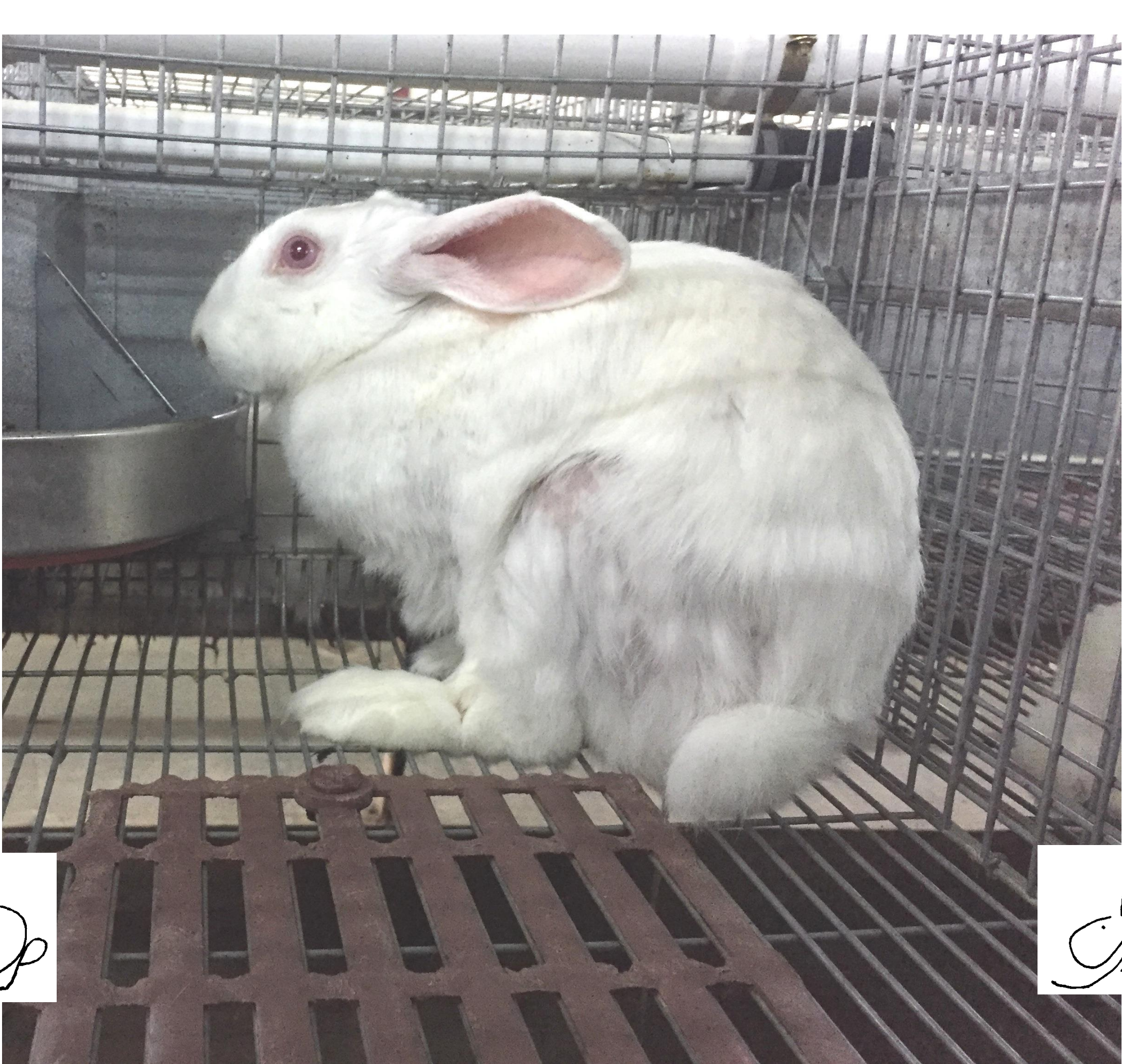
Mastitis: abnormal- antalgic posture, a clinical sign in a diseased doe