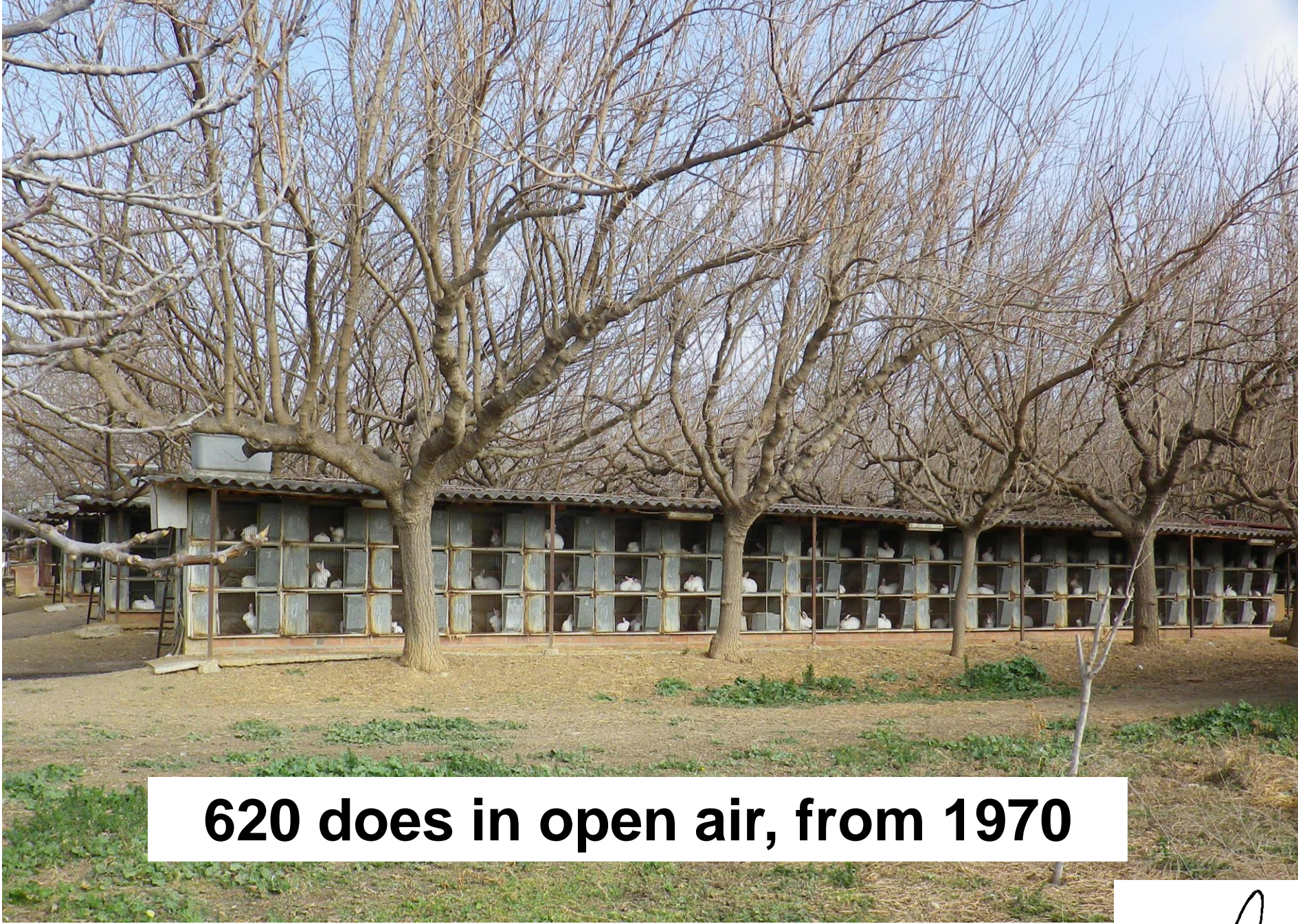
620 does in open air, from 1970

Types of visited rabbitries and with examined does, during 2001-2017. These are examples, not necessarily affected by staphylococcosis.