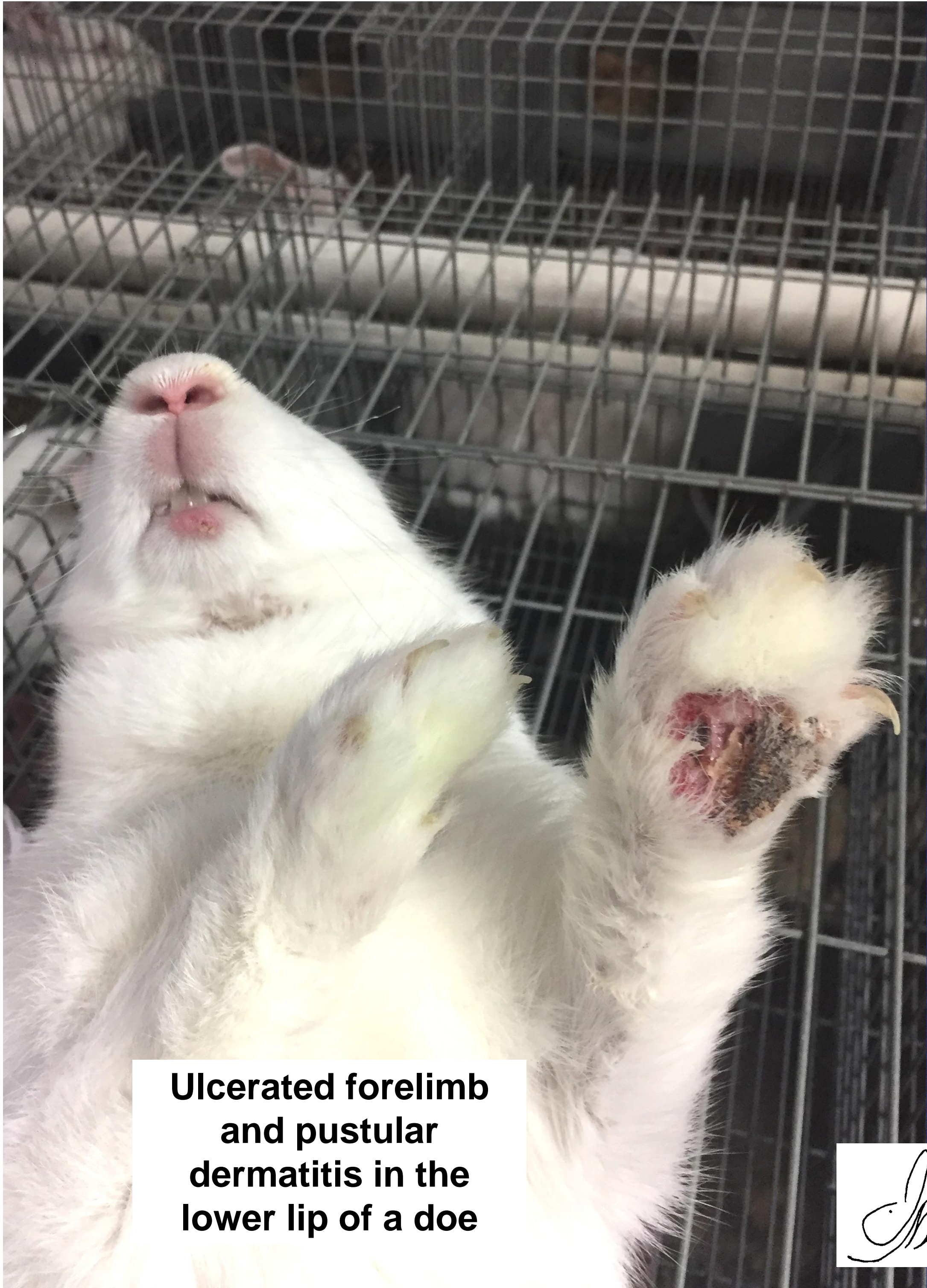
Ulcerated forelimb and pustular dermatitis in the lower lip of a doe