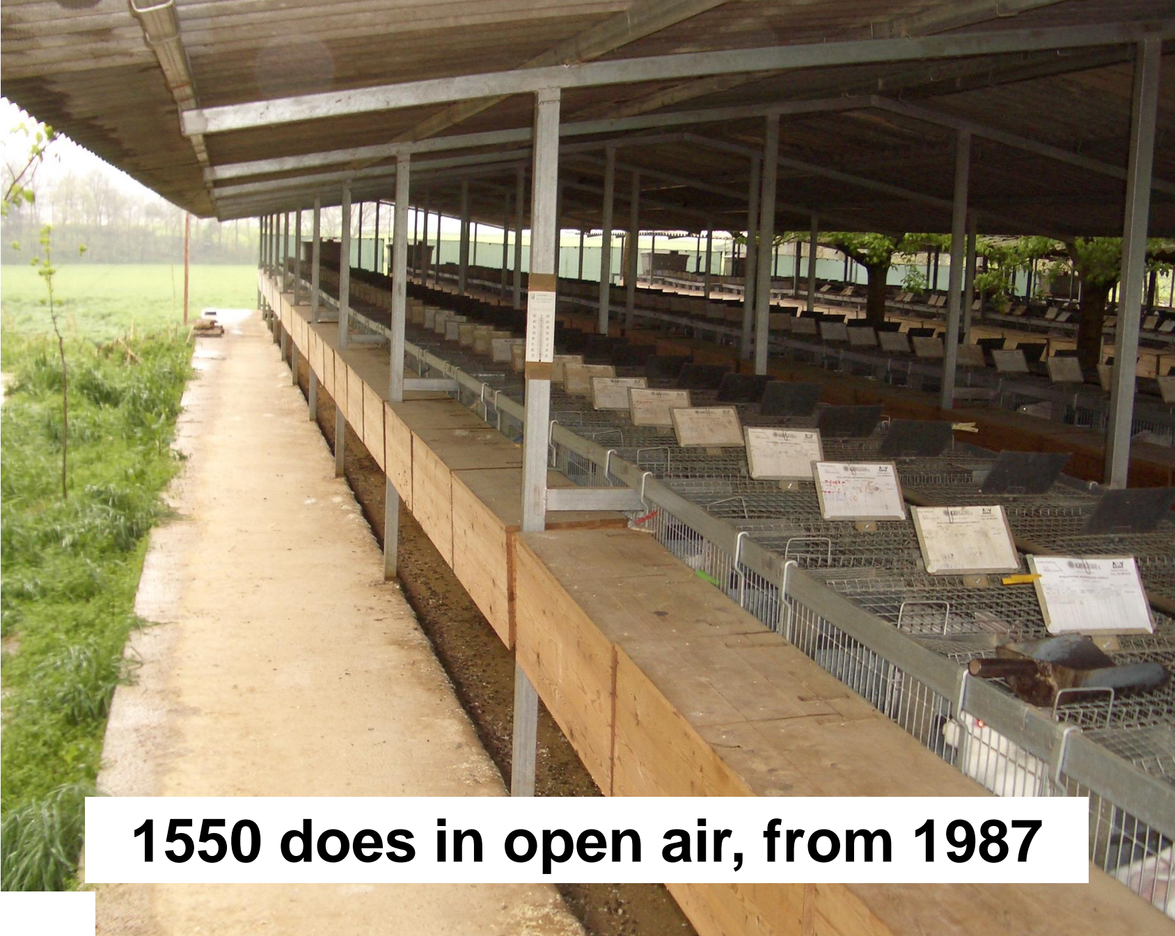
1550 does in open air, from 1987